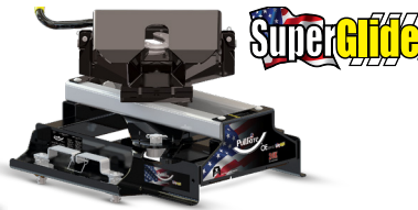
OE Puck SuperGlides 2714 - 16K for Ford OE Puck trucks 2715 - 16K for GM OE Puck trucks 2914 - 20K for Ford OE Puck trucks 2915 - 20K for GM OE Puck trucks 2315 - 24K for Ram OE Puck trucks 4500 - 24K for GM OE Puck trucks