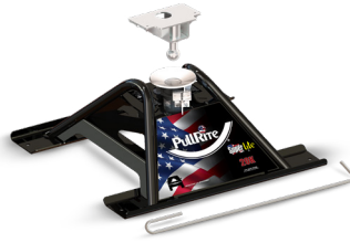
Super Lite #2600 - 20K (SuperLite King Pin Adapter and Handle included)

NOTE: In order to determine the total tow capacity of a system, you must consider the weight ratings of each component in that system. Actual tow capacity of the system will be equal to the lowest rated component, including the vehicle tow rating.