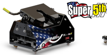
OE Puck Super 5 th 's 1300 - 18K for Ford OE Puck trucks 1400 - 25K for Ford OE Puck trucks 1500 - 18K for GM OE Puck trucks 1600 - 25K for GM OE Puck trucks 1800 - 25K for GM OE Puck trucks