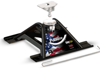
Super Lite #2600 - 20K (SuperLite King Pin Adapter and Handle included)

NOTE: In order to determine the total tow capacity of a system, you must consider the weight ratings of each component in that system. Actual tow capacity of the system will be equal to the lowest rated component, including the vehicle tow rating.