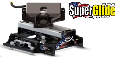
OE Puck SuperGlides 2714 - 16K for Ford OE Puck trucks 2715 - 16K for GM OE Puck trucks 2914 - 20K for Ford OE Puck trucks 2915 - 20K for GM OE Puck trucks 2315 - 24K for Ram OE Puck trucks 4500 - 24K for GM OE Puck trucks