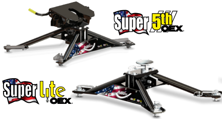
OEX Series 4700 - 25K OEX Super 5 TH for Ford OE Puck trucks 4715 - 25K OEX SuperLite for Ford OE Puck trucks 4800 - 25K OEX Super 5 TH for Ram OE Puck trucks 4815 - 25K OEX SuperLite for Ram OE Puck trucks 4900 - 25K OEX Super 5 TH for GM OE Puck trucks 4915 - 25K OEX SuperLite for GM OE Puck trucks