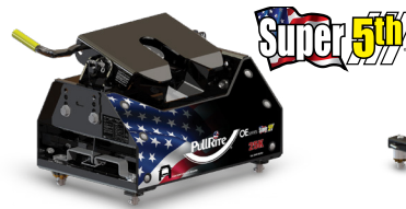
OE Puck Super 5 th s 1300 - 18K for Ford OE Puck trucks 1400 - 25K for Ford OE Puck trucks 1500 - 18K for GM OE Puck trucks 1600 - 25K for GM OE Puck trucks 1800 - 25K for GM OE Puck trucks