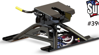
Super 5th #3900 - 24K